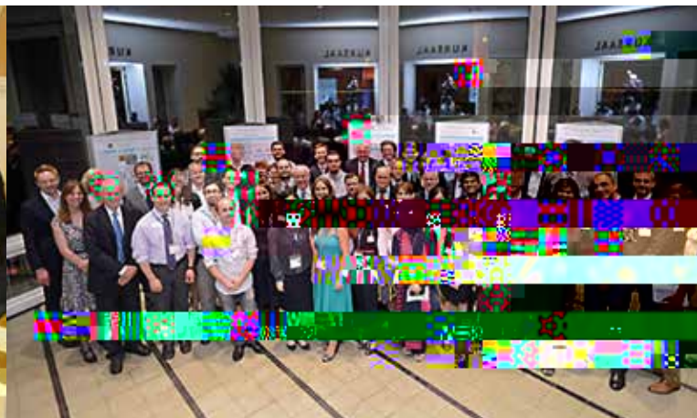
Bayer Lindau Fellows meet with Bayer scientists at the Lindau Nobel Laureate Meeting 2014 to exchange on “pioneering research for the benefit of society.”