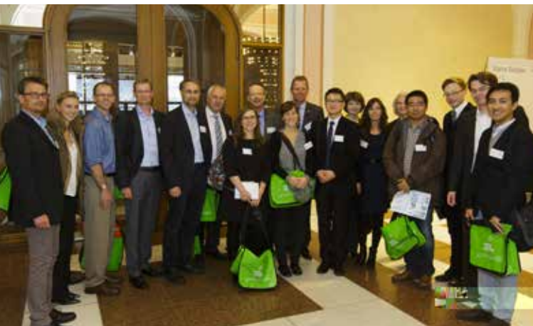
Bayer Humboldt Foundation Fellows at the “Science for a Better Life Symposium” in Leverkusen, 2013.

Each year, the Bayer Science & Education Foundation supports 20 young researchers from around the world to attend the conference as “Bayer Lindau Fellows.” Furthermore, the foundation organizes science dialogue evenings to exchange ideas and scientific spirit between fellows and senior industry scientists.